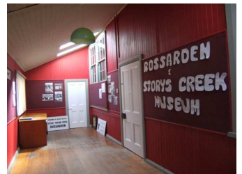
Preparing the Rossarden and Storys Creek Museum