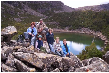
Tranquil Tarn Ben Lomond

At Avoca the Old School building in Boucher Park has now been straightened and is currently being painted by locals and will open in January 2012 as the Avoca Museum and Information Centre, showcasing the history of this area where many families still carry the names of the first European settlers.