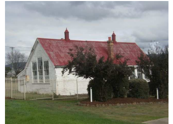
Avoca Museum and Information Centre

Eager mountain climbers can climb the southern slopes of Ben Lomond from either Storys Creek to Tranquil Tarn and Stacks Bluff or approx 5km past the golf course turn left to commence the Bent Bluff climb. After descending Pepper Hill explore the beautiful valley town of Mangana and on to either Mathinna and the Evercreech forest where the tallest white gums in the world can be found on an easy five minute walk from a delightful picnic ground or turn right and over the bridge to Fingal.