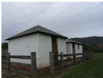
Fingal Convict lock-up

Visitors to Avoca are invited to take an alternate route to Fingal and enjoy the tall cool trees as they drive up the southern slopes of Ben Lomond to the once thriving mining town of Rossarden where fallow deer roam the streets. Hardworking locals have painted the Community Centre, previously the Primary School, in preparation to opening as the Rossarden and Storys Creek Museum focusing on the mining history of this once vibrant town. The views of Ben Lomond are stunning. 5km further on is the beautiful golf course soon to be reopened as the Ben Lomond Eco Resort with 16 luxurious cabins.