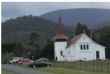
'The Cathedral of the Valley' Mangana