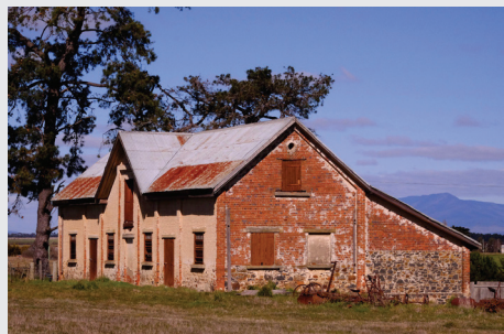
Work Shed at Woolmers, Longford