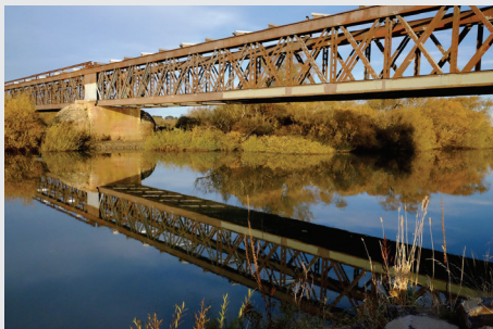
Bridge, Longford - Rod Oliver