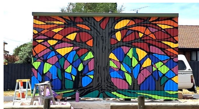
The newly painted mural at the bus shelter at Avoca

A huge thank you to everyone involved for their enthusiasm and hard work.