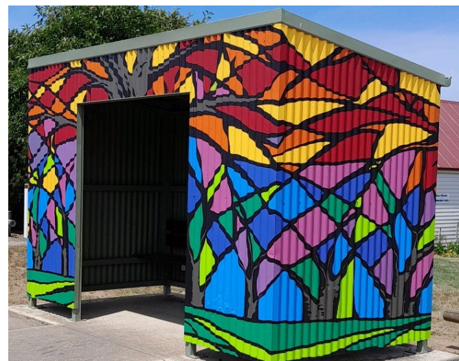
Finished view - Bus Shelter ready for a new school year 2025

We look forward to seeing more community-led projects that celebrate creativity across the Northern Midlands.