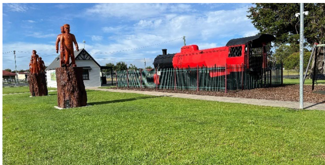
Train Park, 29A Main Street, Perth - Australia Day 2025