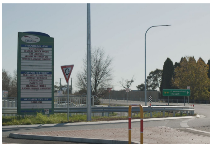
TRANSlink industrial precinct

Once a small nucleus of low-key business developments, the TRANSlink precinct is now a thriving business estate engaged in a diverse array of activities including freight, transport, civil construction, food wholesalers and distributors, furniture manufacturers, engineering services, and other support services such as cafés.