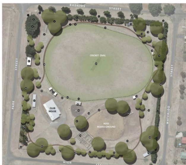
Ross Recreation Ground

Inclusive clubrooms/changerooms, public toilets, main entry point and access points, ticket booth refurbish, perimeter fence, cricket wicket, gravel circuit and oval perimeter fence, new sheds, dog exercise park, picnic shelter, rodeo ground, shade sails and seating.