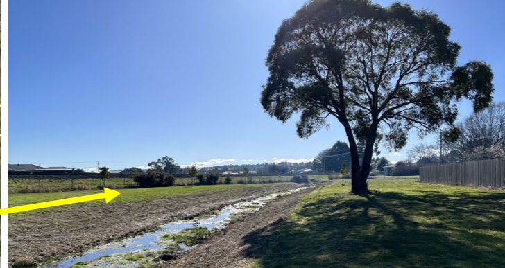
Stage 2: The realignment of Sheepwash Creek including broadening/lowering of the creek line, installation of an additional culvert and pedestrian access under the rail line, realigning the creek to a more natural alignment. Currently the creek runs alongside Youl Road before passing under the existing road and rail culverts which are at right angles to the direction of flow.