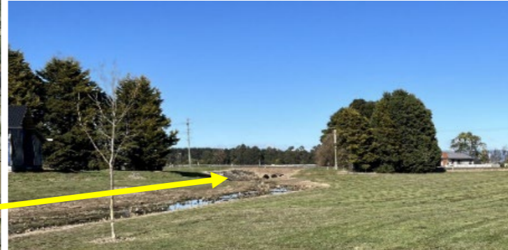
Stage 1: Drummond Street culvert/bridge replacement.