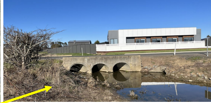
Stage 3: Edward Street culvert/bridge replacement.