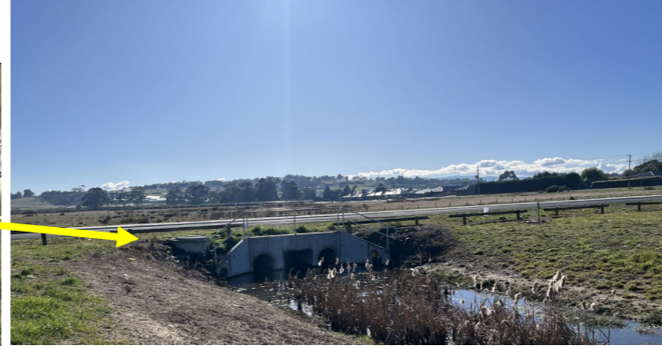
Stage 3: Phillip Street culvert /bridge replacement.