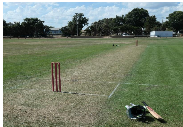
1 - Collaborated with Veterans Cricket Tasmania to develop turf wickets at the Ross Recreation Ground