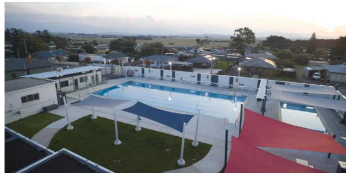
3 - Upgraded the Cressy Memorial Swimming Pool Complex including renovation and modernisation of the kiosk and storage area, creation of a new entrance, construction of a raised shaded and sheltered deck, gel coating of the two pools and relining of the main pool, upgrades to the concourse including building the concourse to create a flush entry to the pool, replacing the concrete surrounds with tiles, a new fence and sealing, line marking and landscaping of the complex carpark.