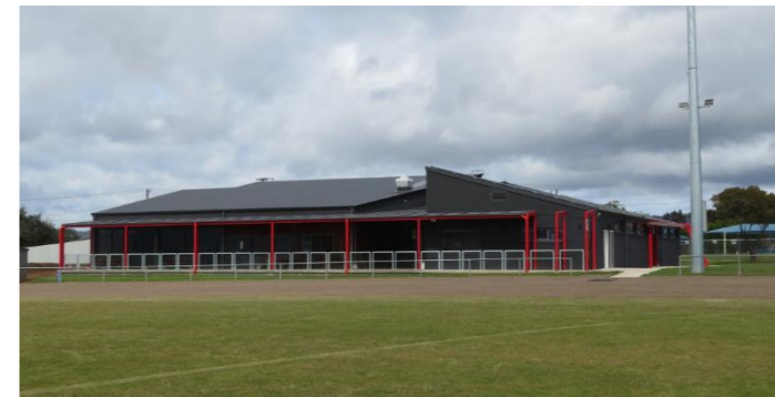
6 - Developed a new multi-function centre/clubrooms and meeting rooms with inclusive changerooms at the Campbell Town War Memorial Oval Precinct, and two new tennis/multipurpose courts, and upgrades to the oval lighting and a new electronic scoreboard.