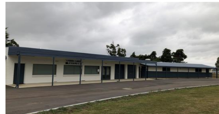
7 - Renovated and expanded the Cressy Recreation Ground clubrooms including constructing new inclusive changerooms and the cricket practice nets.