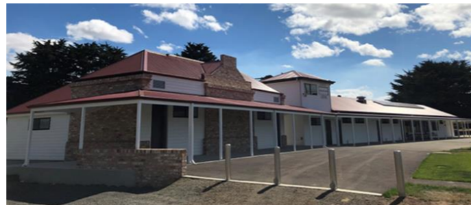
2 - Renovated and expanded the Morven Park clubrooms including constructing inclusive changerooms and installing a new three bay cricket practice facility