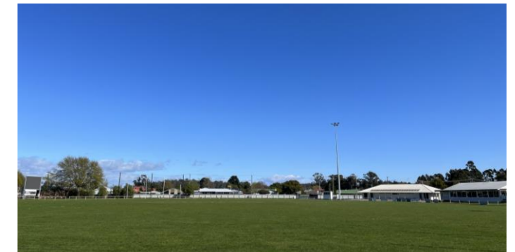
8 - Perth's current recreation ground, which is located adjacent to the Perth Primary School, has several ageing sporting facilities, including the skatepark and an inadequate size oval. Improvements undertaken include upgrades to the oval lighting, installation of an electronic scoreboard and goal netting, a new scorer's box, and resealing of the carpark.

Council has developed a draft concept plan (below) for the development of a green field site into a regional facility however this is subject to land purchase and community need and will likely include a combined AFL and cricket oval, a multi-purpose community centre, new netball and tennis courts, an adventure playground and skatepark/pump track and possibly an aquatic centre and/or football field.