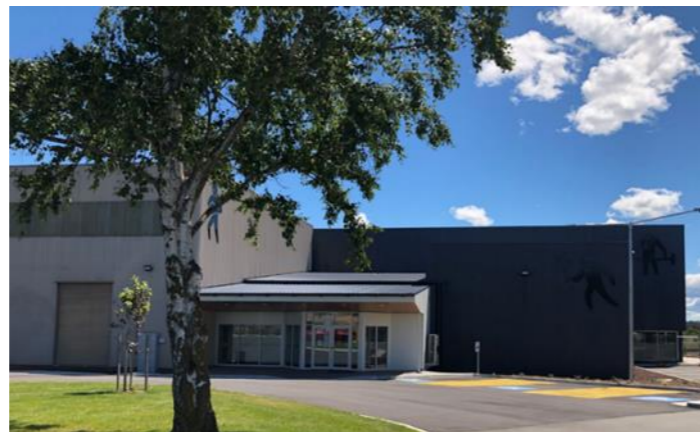
4 - Redeveloped and expanded the Longford Community Sports Centre.