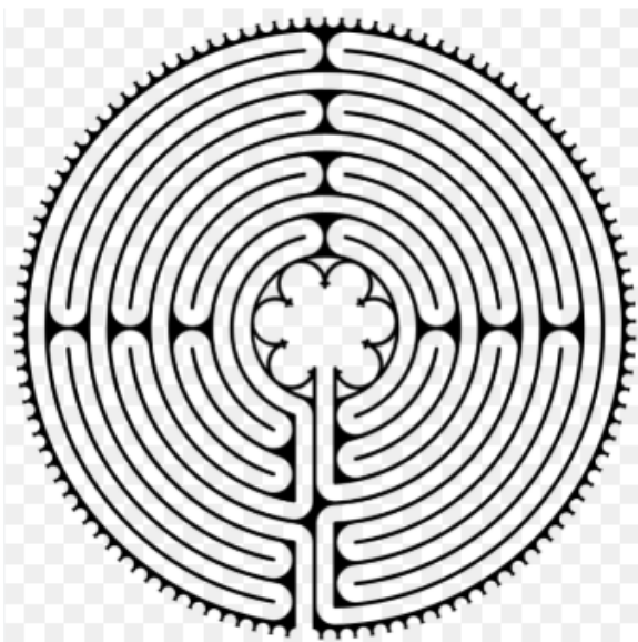
Eleven-Circuit Medieval Labyrinth -