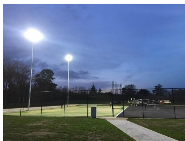
Night lights on the Tennis Courts

The redevelopment has not only revitalised the oval precinct but has also seen the relocation of the Town's tennis courts, creating a seamless integration of sporting amenities. The public swimming pool now utilizes the new centre's amenities, further enhancing the community's access to recreational facilities.