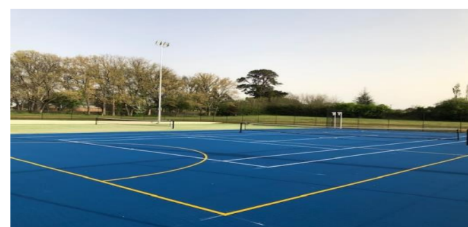
The Multi purpose courts

Apply Now! Join the Northern Midlands Council Local Recycling Committee!! There are five community member vacancies for the current term ending June 30, 2024. Visit www.northernmidlands.tas.gov.au for details and details. Applications before March 8, 2024