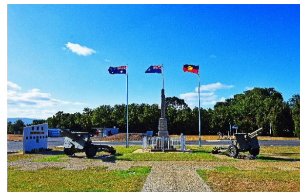
Upgraded and enhanced Cenotaph

This collaboration marks a significant milestone, positioning the facility as a hub for not only local but also regional sports development.