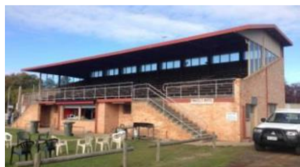
The dilapidated old grandstand/clubhouse

The redevelopment has not only revitalised the oval precinct but has also seen the relocation of the Town's tennis courts, creating a seamless integration of sporting amenities. The public swimming pool now utilizes the new centre's amenities, further enhancing the community's access to recreational facilities.