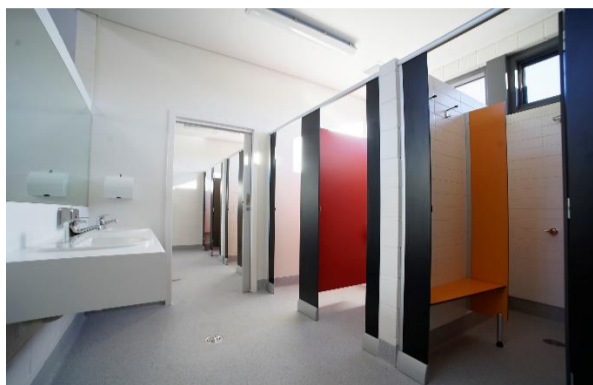
Interior of new Inclusive Toilets & Change rooms.

unveiled new change rooms designed to cater for both male and female sporting fixtures, and umpires. This innovative addition enhances the facility's versatility, breaking down barriers and fostering equal opportunities for all in the sporting arena.