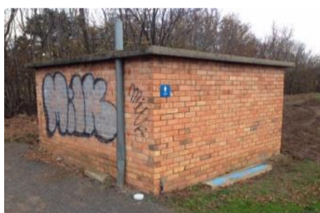
Former old toilet/shower block

Local sporting organisations and community members have praised the initiative acknowledging the positive impact, fostering a sense of belonging and equal opportunity. In a strategic move, the AFL Academy has chosen this centre as its base, conducting programs and training days within its state-of-the-art facilities. This project won first place in the 2019 AFL Ken Gannon Community Football Facilities Awards.